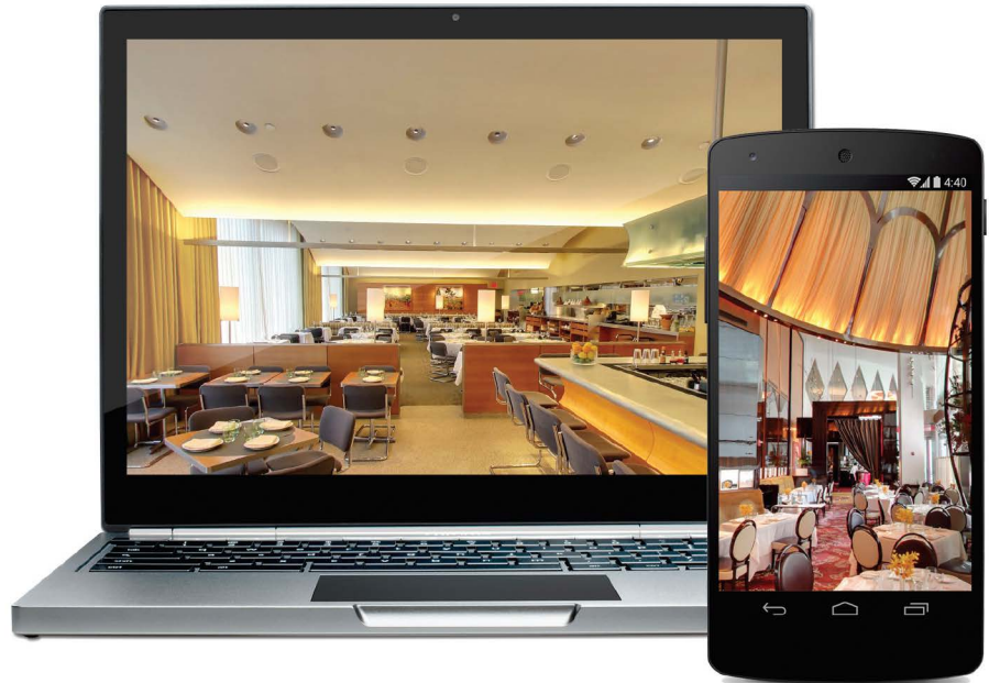
Tour business interiors with Google Maps Business View on desktop, mobile, and tablet devices